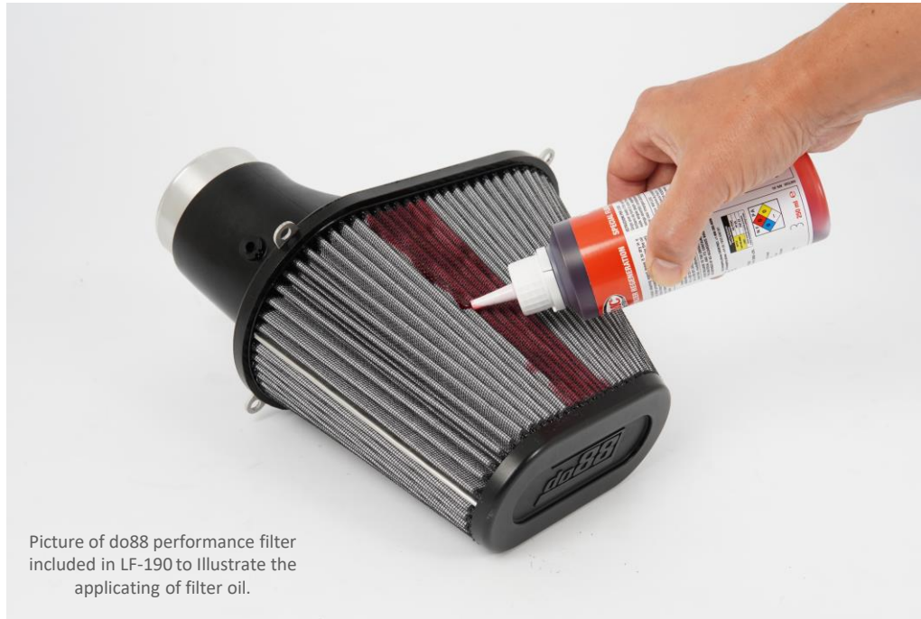
Picture of do88 performance filter included in LF-190 to illustrate the applying of filter oil.